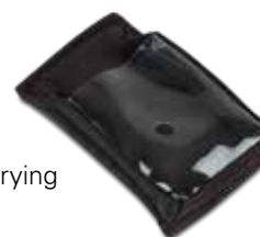
Nylon Carrying Case