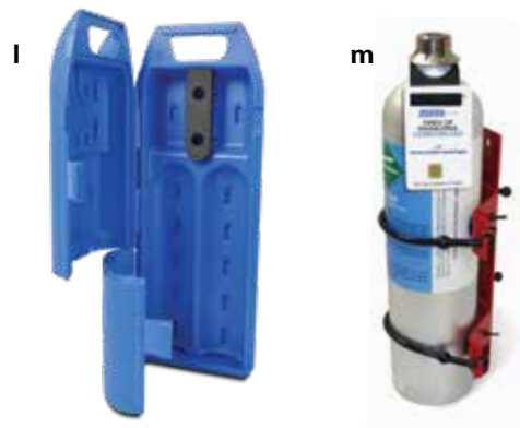
(l) 17037961 – Carrying Case for 2 Cylinders (58 L)