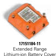
VTSB-201 Extended Range Lithium-ion Battery Kit