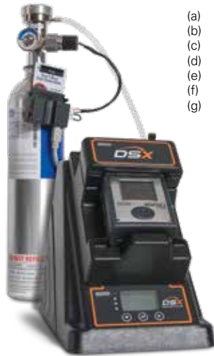
MX6 iBrid DSX Docking Station shown with a Demand Flow Regulator (18105841) and cylinder connected to an iGas® Reader (18105684).